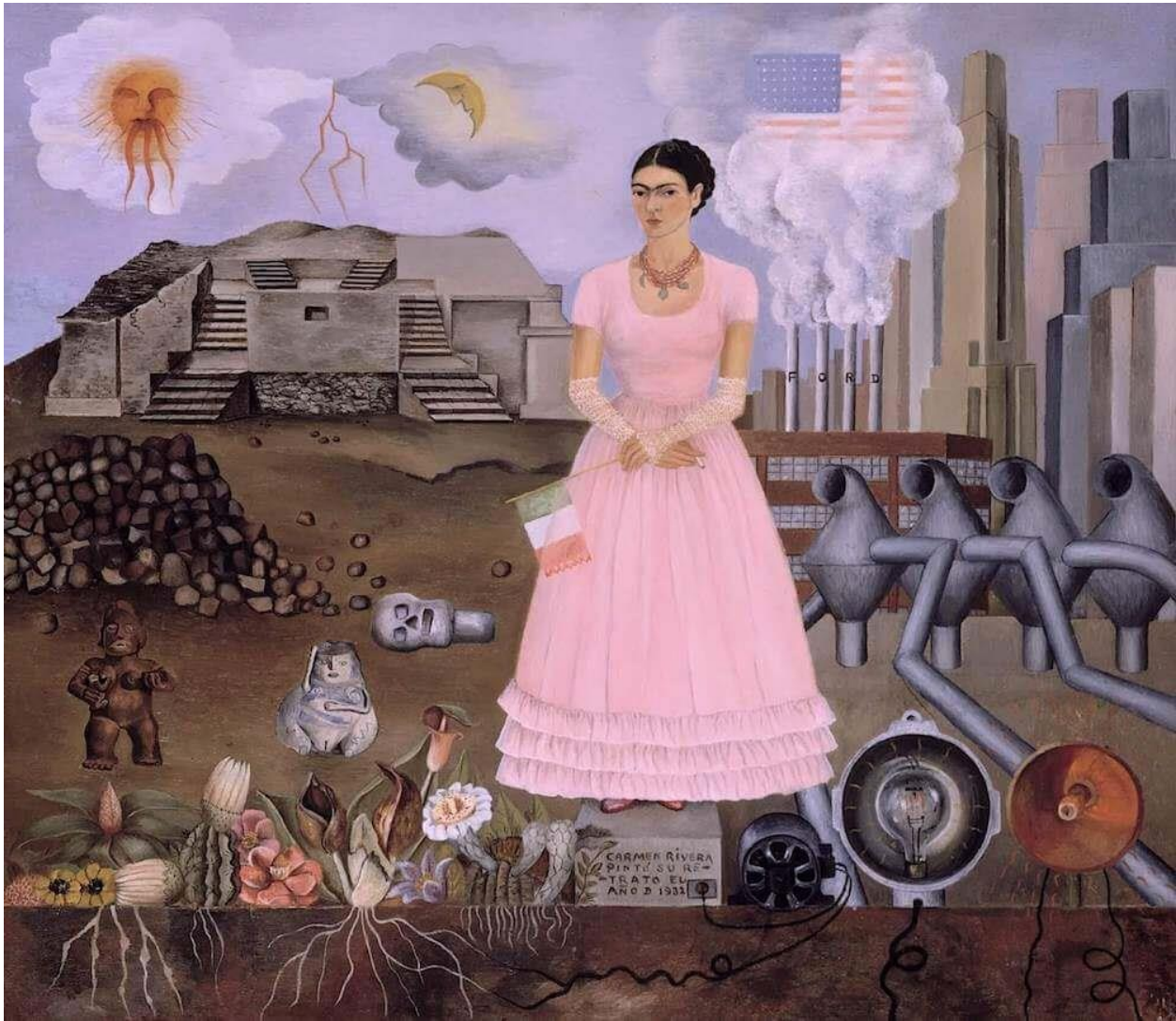
1Self Portrait Along the Border Line Between Mexico and the United States, 1932

As mentioned in the video, drawing symbols (icons), lines, shapes, facial expressions, etc. enable us to creatively express what we are sensing. Over time you will find your creative drawings and painting will shift away from doodles and begin to contain messages like an instrumental song or a dance. Writing words is not the only way to express and learn about ourselves.